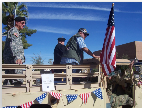
One of the vehicles in the parade with DAV-36 members