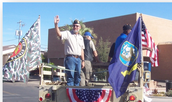
. 2nd vehicle in parade