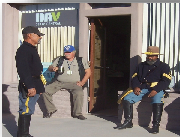
Two Buffalo Soldiers in front of DAV-36